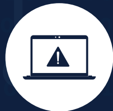
ELECTRONIC DATA INCIDENT