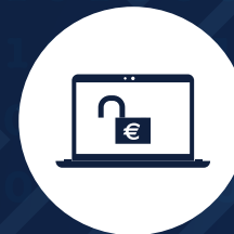
CYBER EXTORTION / RANSOMWARE