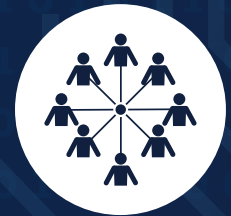
THIRD PARTY CLAIMS